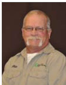
Alan Eul Cable Locator